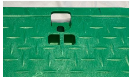
1 BOLT OPTION ON UP1520 – SHOWN ABOVE